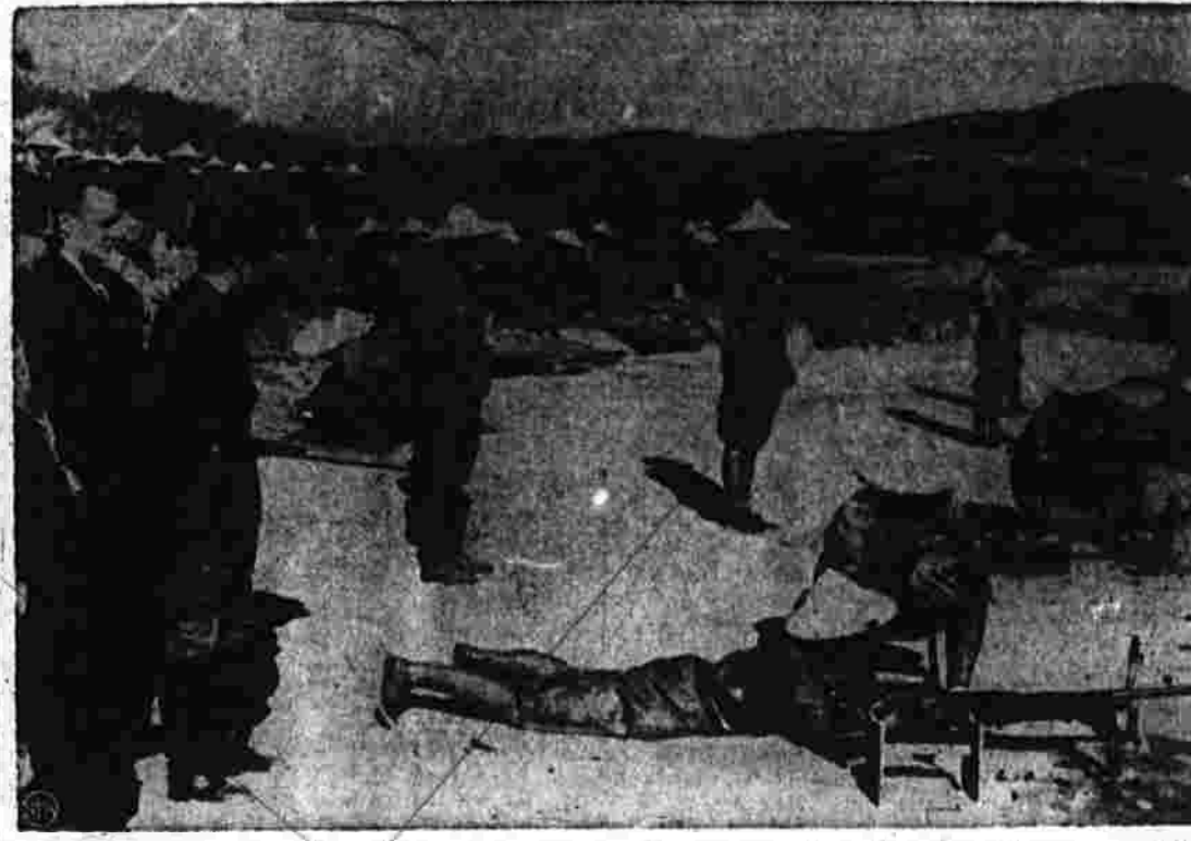
Gen. Sun Li-jan (left foreground), commander of Chinese Nationalist forces on Formosa, watches troops at automatic rifle training on the threat of island. Directly behind the general is U. S. Senator William F. Knowland (R., Calif.), who released this picture on his recent return from an inspection tour of the area.